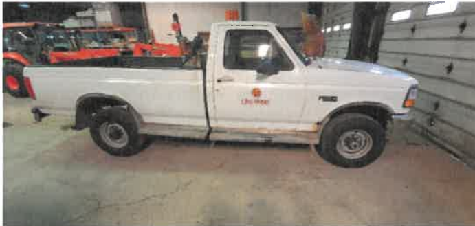
Asset # 10045