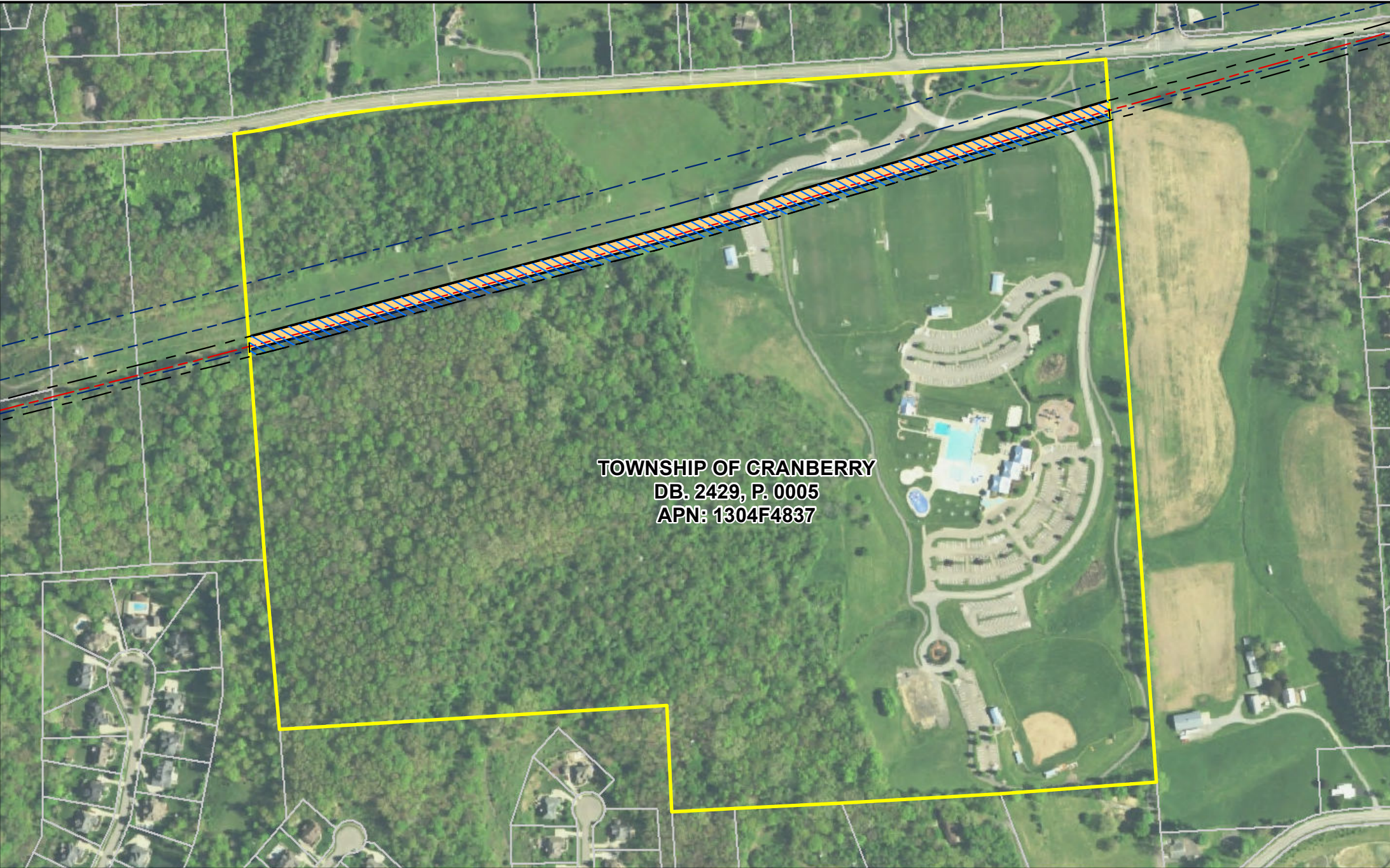
EXHIBIT "1" EASEMENT OPTION

PROPOSED EASEMENT OPTION OVER THE LANDS OF: