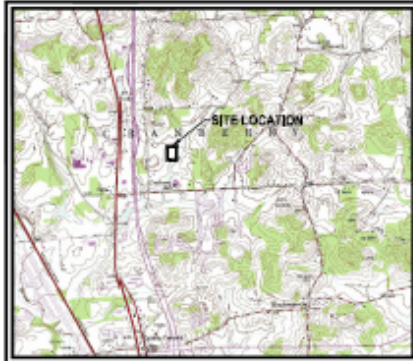
Site Location Map Topographic Not to Scale For Reference Only