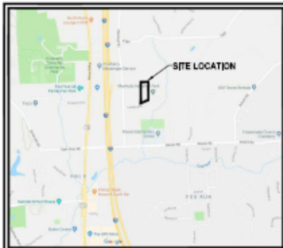
Site Location Map Street Map Not to Scale For Reference Only

SITUATE IN: CRANBERRY TOWNSHIP BUTLER COUNTY PENNSYLVANIA